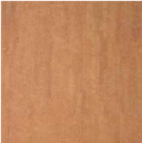
R02343 Circeo Rett. (60x60) 93 PEI IV R9