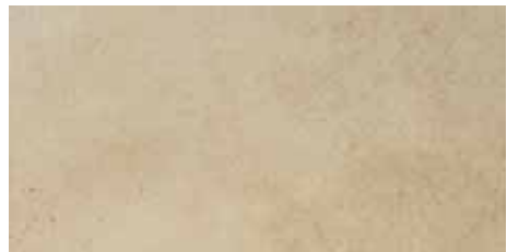
R02339 Queens Rett. (30x60) 94 PEI IV R9