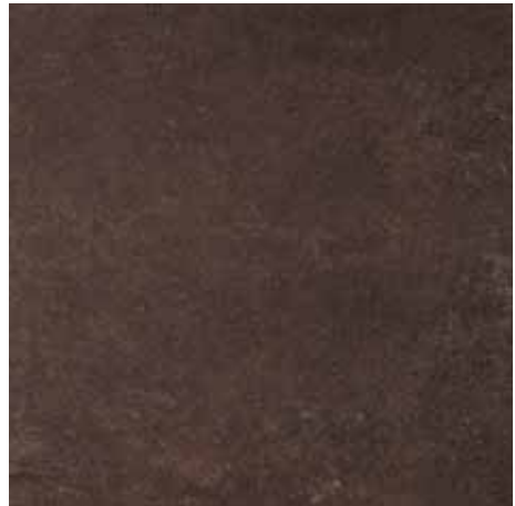
R02342 Stelvio Rett. (60x60) 93 PEI IV R9