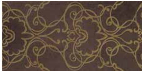
201368 Lincoln Brown (30x60) 71 Pz. Box 4