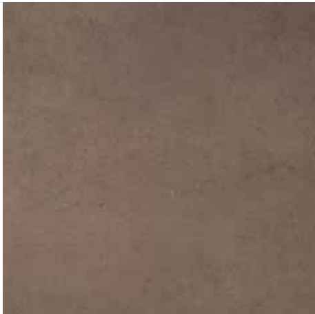
R02340 Bronx Rett. (60x60) 93 PEI IV R9