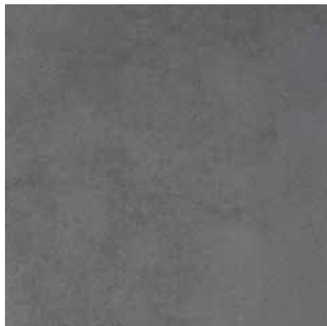
R02334 Manhattan Rett. (60x60) 93 PEI IV R9