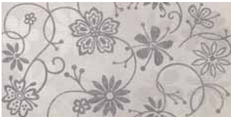
201364 Broadway Grigio (30x60) 87 Pz. Box 4