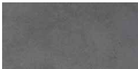
R02335 Manhattan Rett. (30x60) 95 PEI IV R9