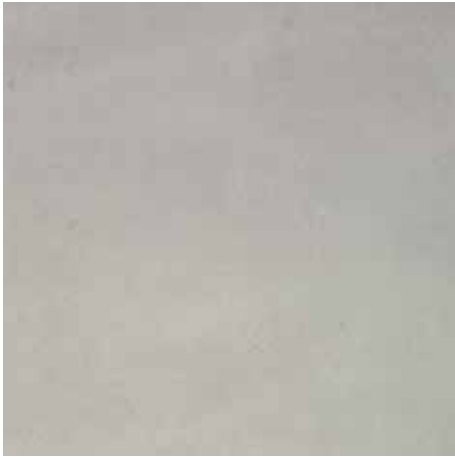
R02403 Staten Island Rett. (60x60) 92 PEI IV R9