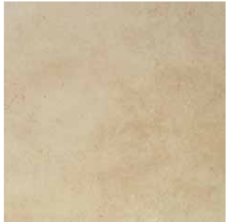
R02338 Queens Rett. (60x60) 92 PEI IV R9