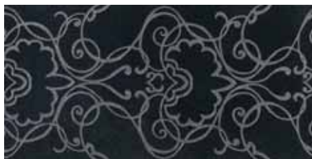
201367 Lincoln Antracite (30x60) 71 Pz. Box 4