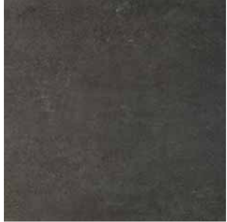
R02344 Asinara Rett. (60x60) 93 PEI IV R9