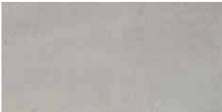
R02404 Staten Island Rett. (30x60) 94 PEI IV R9