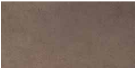
R02341 Bronx Rett. (30x60) 95 PEI IV R9