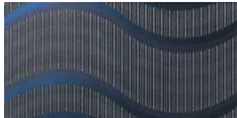
201361 Madison Antracite (30x60) 57 Pz. Box 4