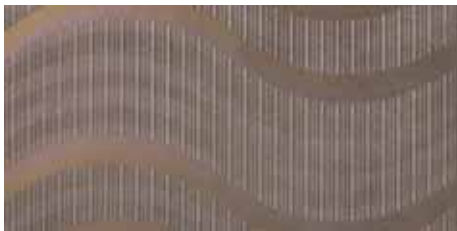
201362 Madison Brown (30x60) 57 Pz. Box 4