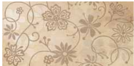
201363 Broadway Beige (30x60) 87 Pz. Box 4