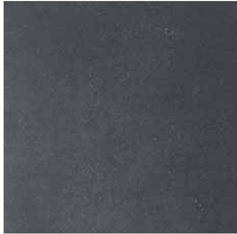
R02336 Brooklyn Rett. (60x60) 93 PEI IV R9