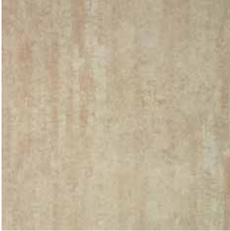
R02345 Pollino Rett. (60x60) 92 PEI IV R9